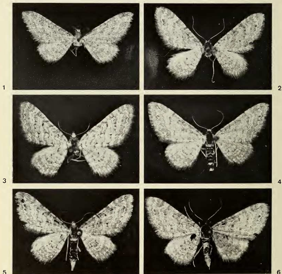
Figs 1-6. 1. Eupithecia salami BRANDT, Holotype ; 2-5. Eupithecia domogledana sp. nov., Paratypes ; 6. Holotype.

PARATYPES : 11 ♂♂ and 3 ♀♀, from Mount Domogled, all taken between 20th July 1979 and 21st July 1986 by E. SZABÓ. Deposited in the "Antipa" Museum, Bucharest (5 ♂♂, 1 ♀), coll. Endre SZABÓ, Satu Mare, (4 ♂♂, 1 ♀), and the Hungarian Natural History Museum, Budapest (2 ♂♂, 1 ♀). ♂ genitalia slides : DRAGHIA/238 ; VOJNITS/17810, 17812, 18060. ♀ genitalia slides : VOJNITS/17813, 17814, 18061.